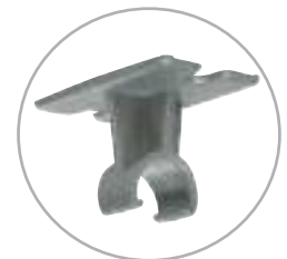
under desk clip-on fixing bracket