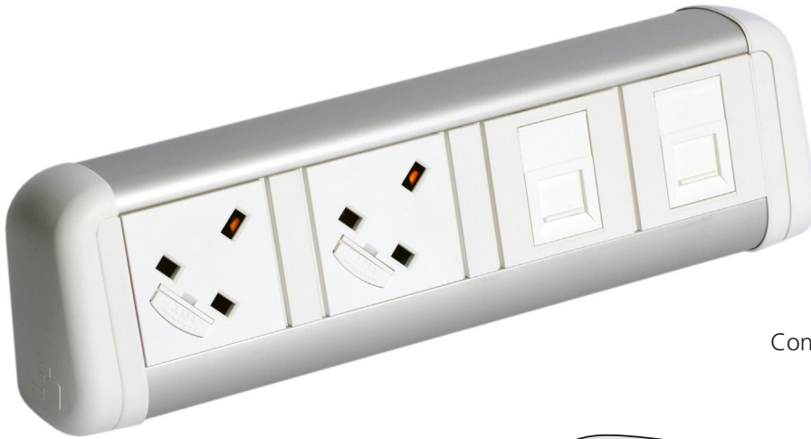
Contour module shown is 94MUS01W

Contour has a modern, curved appearance displaying many design features like our new lateral fuse carrier, internal segregation between power and data and comes complete with plastic clips on the covers so there are no visible fixing screws and fully compliant to current safety regulations.