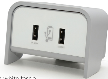
Grey with white fascia