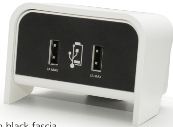
White with black fascia

This new module is available in black, grey and white as standard but has been designed to present a number of options for contrasting housing, fascia graphic and outer cover subject to minimum order quantities and lead times. For more information please speak to a member of our sales team.